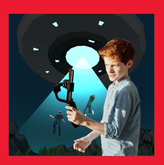
>60% Are Gen Z