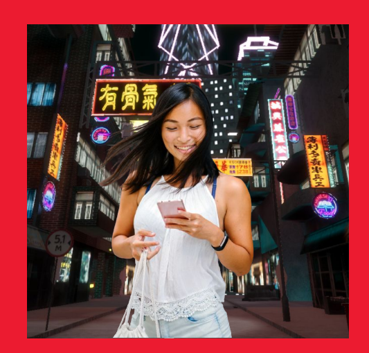
1 Billion MAU

The TikTok Generation of Mobile Video Creators