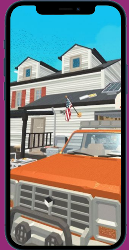
Jump Into 3D Scenes With A Simple Link

Bring easy-to-use, collaborative filmmaking tools to mobile.